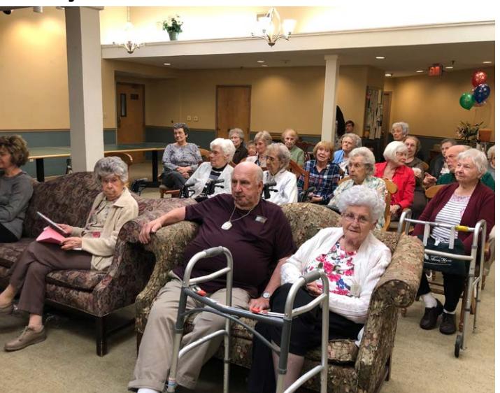
Friends enjoy the beautiful music